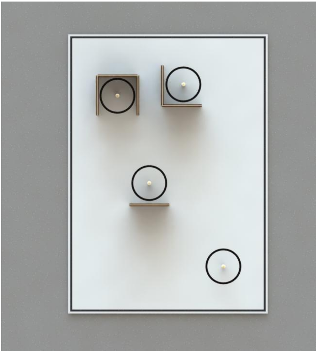
Figure 3 (Top view of the field)